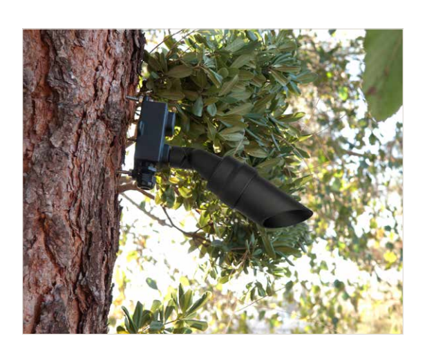
Flexibility Abound With so many features and convenient wattage options, the MD is the go-to halogen down light solution for an array of applications.