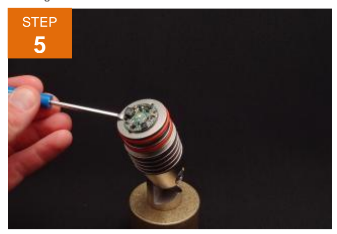
The LED board can now be removed. Using a small soft edged pry device gently pry up on one side of the board. Make sure the base of the fixture where the LED was removed from is clear of debris or residual thermal pad material.