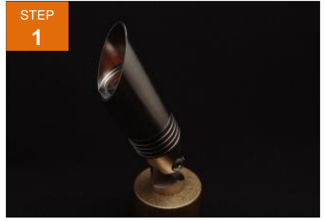
It's always a good idea to change LED boards and lamps with power to the fixture turned off completely.