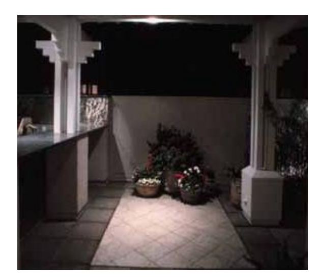
The three pots terminate the view at the opposite end of the patio. But at night there is no impact without FX light.