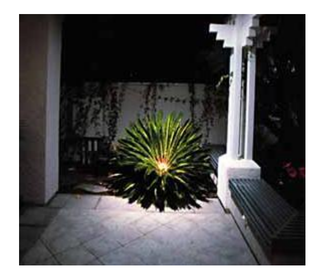
TS-50 mounted in the trellis spotting the Sago it creates a dramatic focal point.