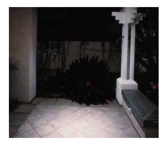
Sago palm without FX lighting.